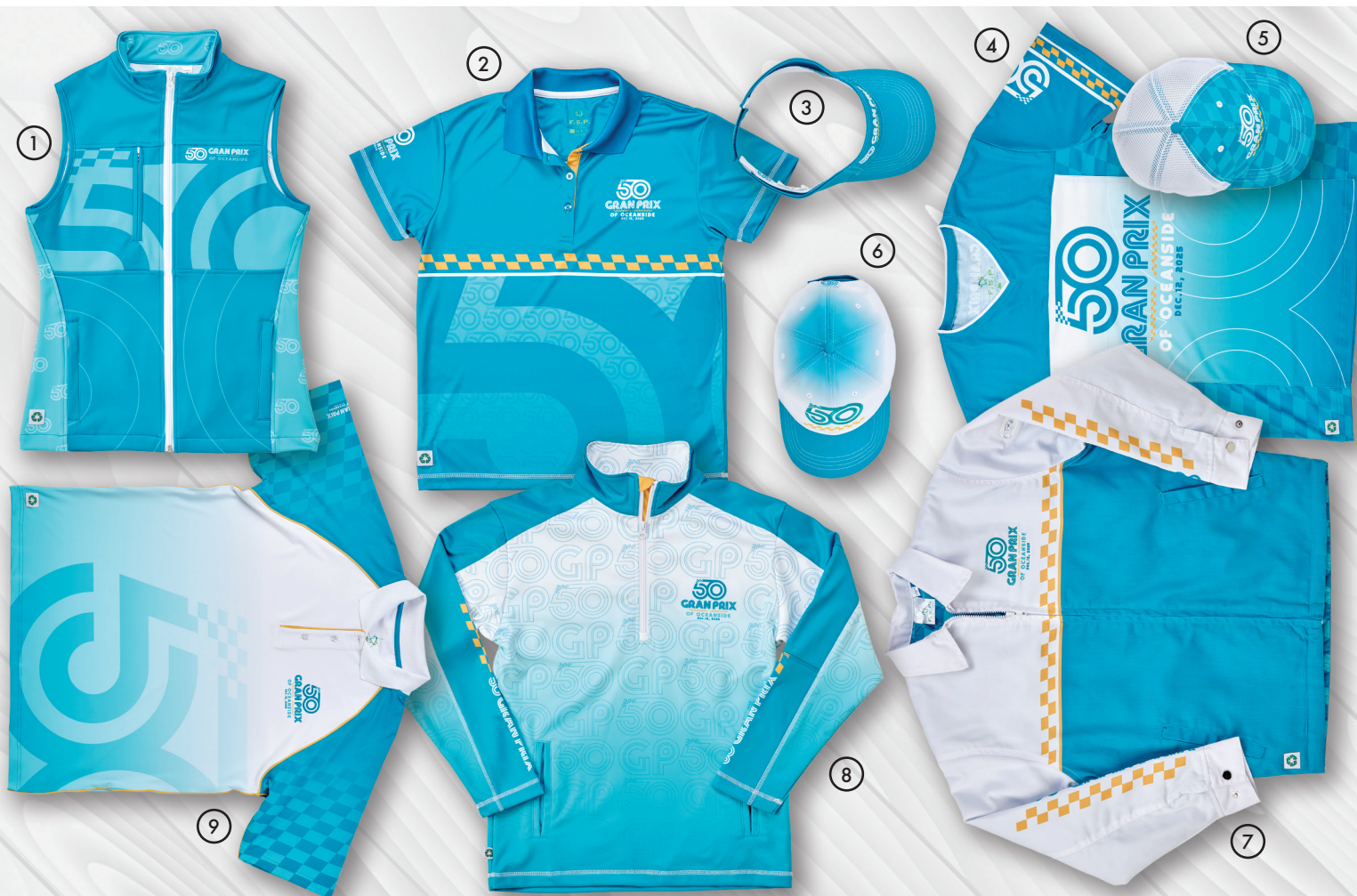
1.) FSP2401 2.) FSP700 3.) 1340QD 4.) FSP2006 5.) 785QD 6.) 171QD 7.) FSP5105 8.) FSP2702 9.) FSP1072

FOR MORE INFORMATION CONTACT YOUR ACCOUNT MANAGER TODAY